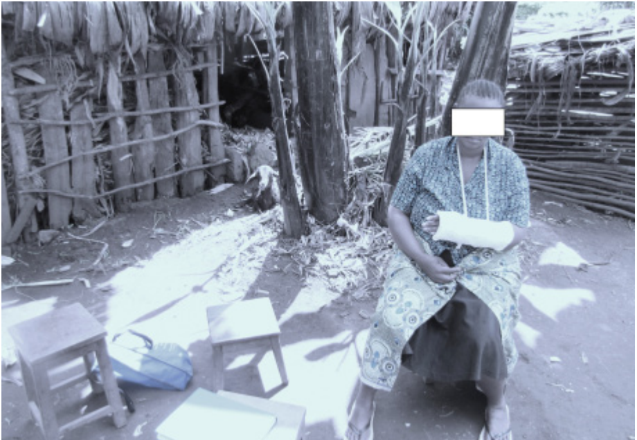
Figure 2: A woman on Kilimanjaro who was beaten by a park ranger in the forest